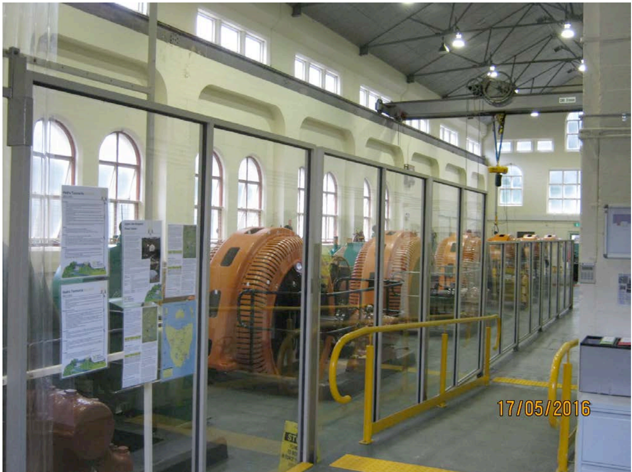
Bank of Turbines. This was good old English engineering these turbines have had little maintenance since they were installed 102 years ago. How they got them there was a feat in itself. There were no formed roads in this part of Tasmania at the time they were installed. Even the building has an architectural quality about it.