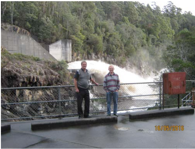
After a very dry period the dams are full again