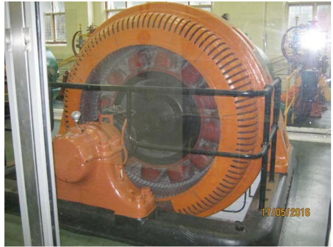
102 year old turbine put in by the Mt Lyle Copper mine