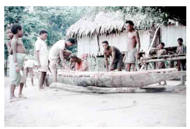
Inspecting the Native Canoe Lakekamo River Papua