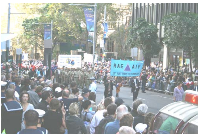
Park Street crowds looking towards George Street