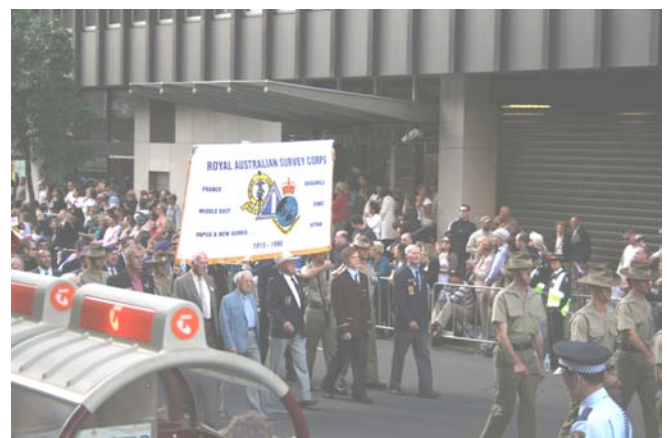
Near the end of the march Park Street