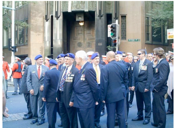
Survey Corps Association Marchers