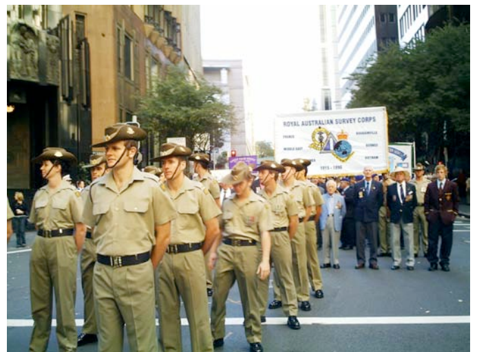
Geomatic Guard and Banner Party