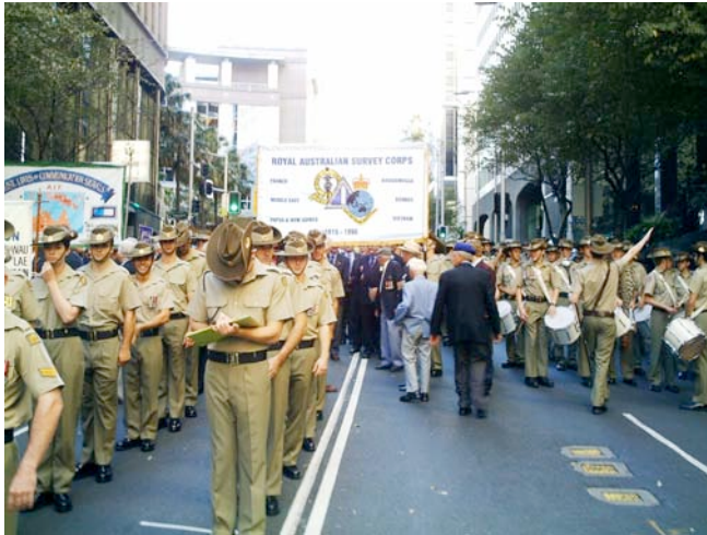
Lining up prior to march

Sydney turned on a glorious autumn day for the 2009 ANZAC Day March, coupled with the huge crowds that lined the route of the march it made it a special Day of Remembrance for all those involved. As in past years members from the Geomatic Wing of SME volunteered to carry the banner and the senior members of the Association took place of honour in front of the new Survey Corps Association banner. In total there were forty four (44) personnel from the Survey Association and Geomatic Wing marching on the day.