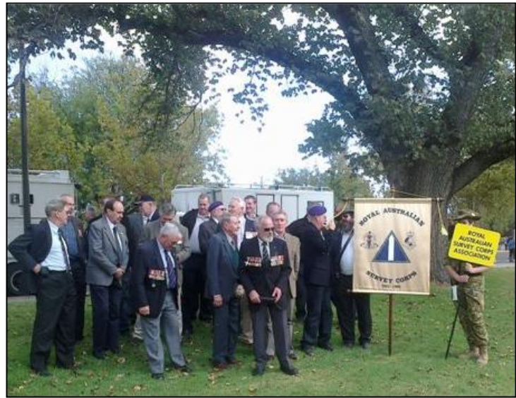
Forming up in South Australia