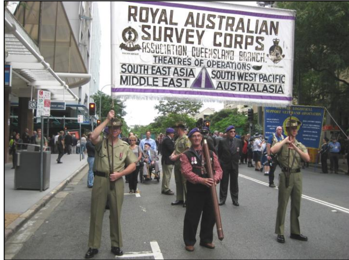
Forming up in George St