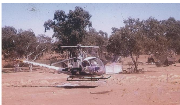
'Helicopter Utilities' somewhere – our air support on many field operations