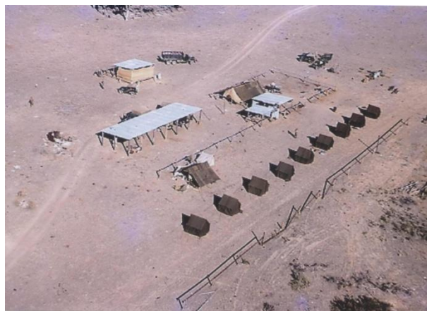
Survey camp at Coen – very orderly