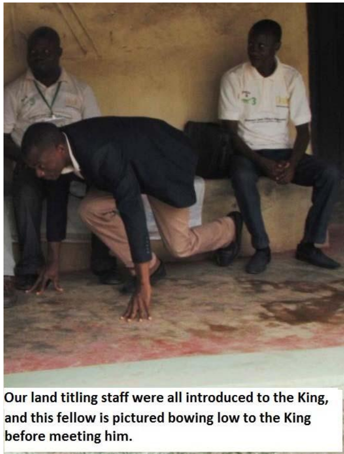
Our land titling staff were all introduced to the King, and this fellow is pictured bowing low to the King before meeting him.