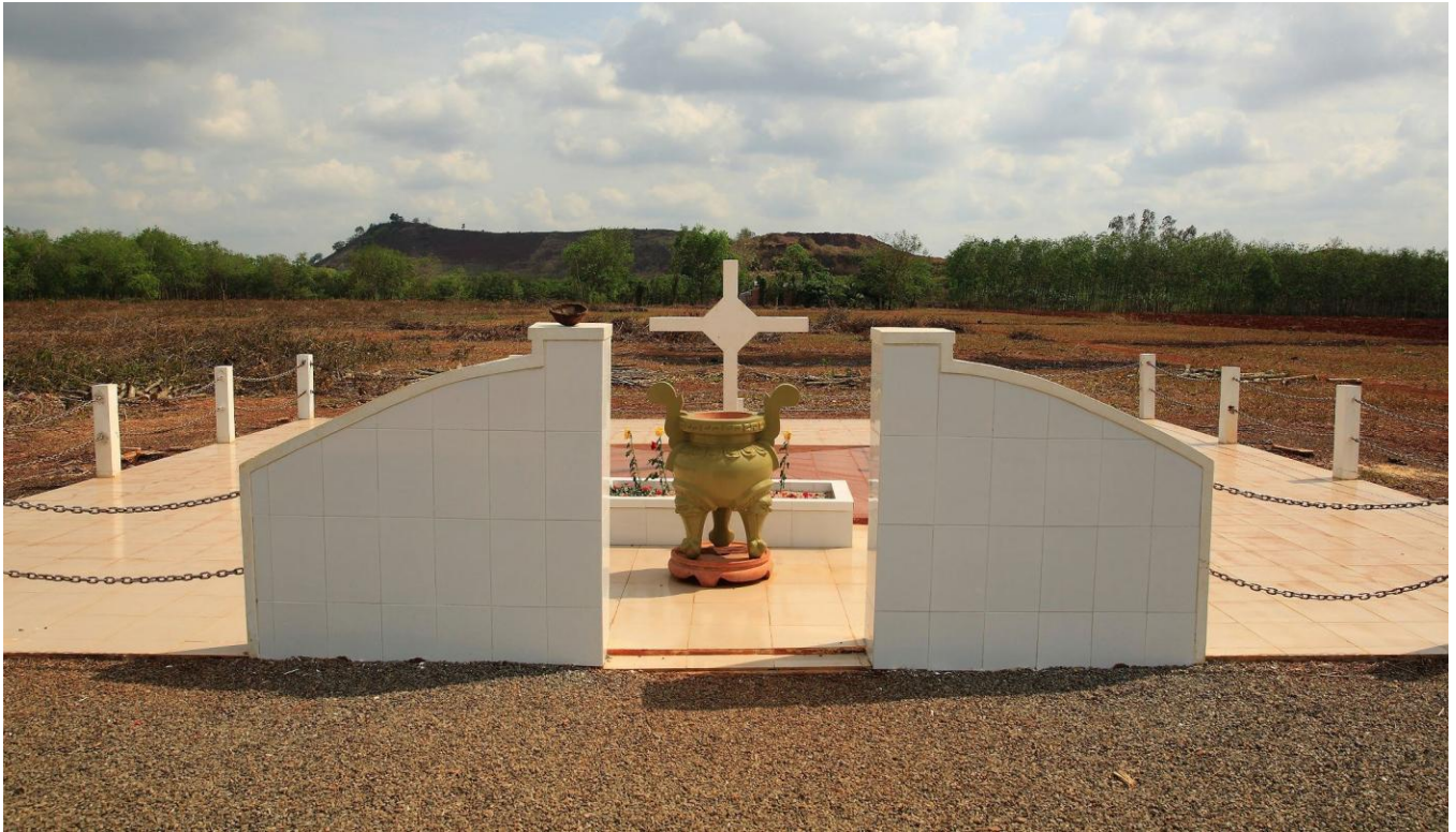
The Long Tan Memorial in the middle of a cleared paddock