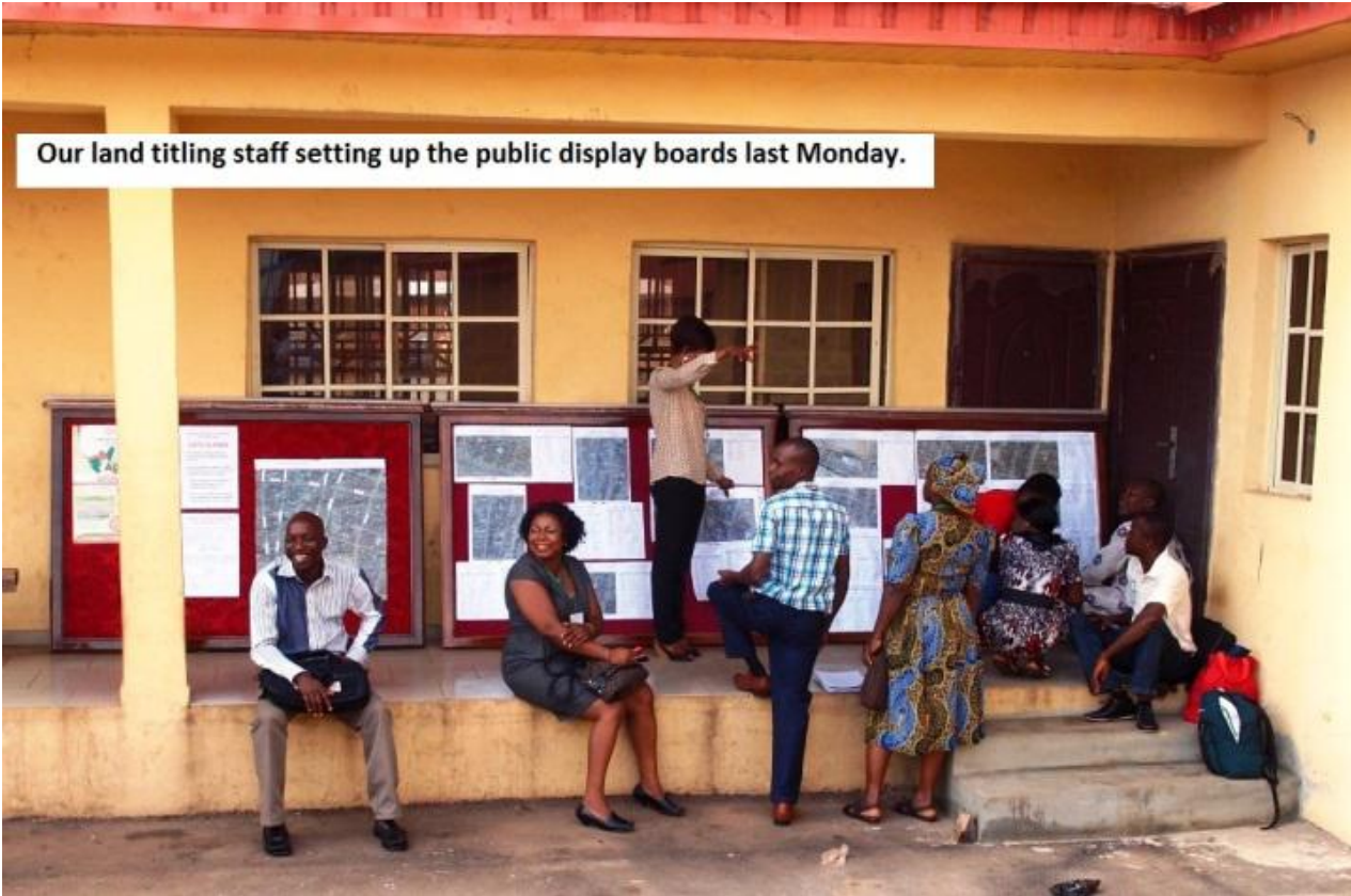
Our land titling staff setting up the public display boards last Monday.