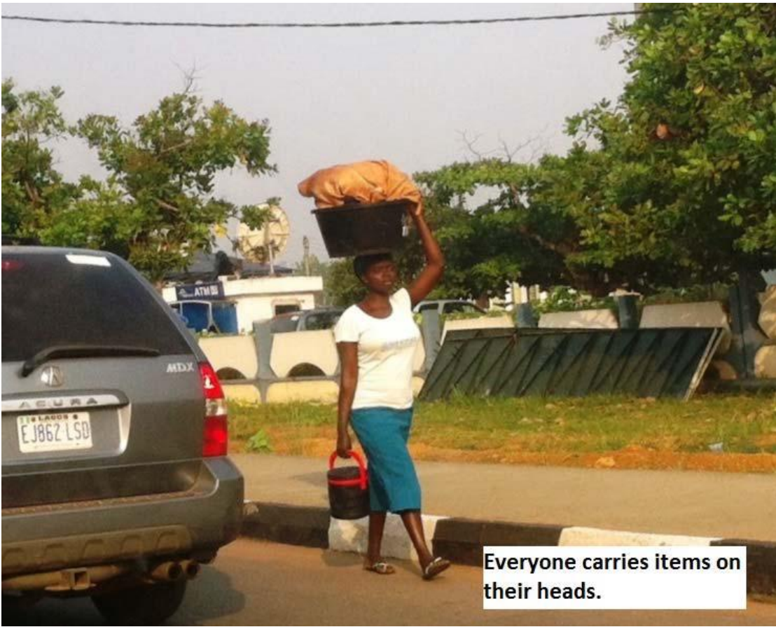
Everyone carries items on their heads.